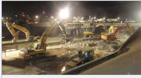
Fall 2011: Workers demolish half of the Montfort Road bridge.

The LBJ Express project will rebuild one of the busiest and most congested highways in North Texas by 2016. Construction began in early 2011. The project is being designed